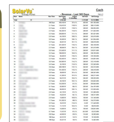
Print PDF reports or download CSV for spreadsheet analysis